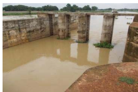
Incomplete Head Works

We noticed that the project was taken up in split up manner. Head works were completed in November 2009, left and right main canals were abandoned mid way (August 2010/January 2011) by contractors and another reach of main canal was execution. The project remained incomplete with expenditure ₹ 9.13 crore (July 2012). The