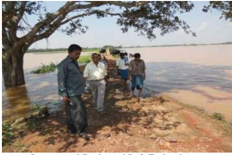
Overtopped Brahmani Left Embankment

We noticed that due to non-raising of the embankment up to a required height including necessary free board together with non selection and inclusion of the projects of weak