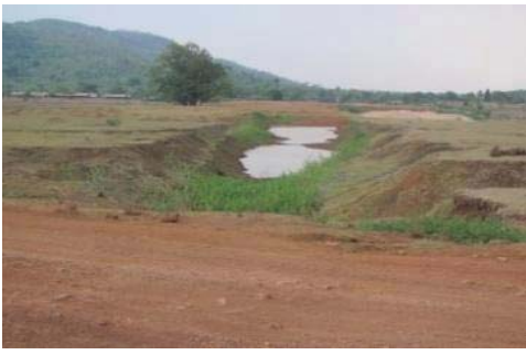
Incomplete Head Works

We noticed that the Ministry of Environment and Forest (MoEF) suggested (November 1990) that rehabilitation plan of project affected families of 21 villages be concurrently implemented completed before six months of the target date for impounding the reservoir. However, 469 families of six villages only were rehabilitated. Subsequently, Odisha University of Agriculture and Technology, Bhubaneswar conducted economic and cultural survey of the affected villages and assessed (2006) that 1220 families were eligible for the R&R assistance. The rehabilitation issue was not solved and the sanction under tranche X lapsed in March 2010. The project