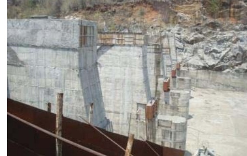
Incomplete Head Works

stipulated for completion in three years (March 2007). The project was incomplete due to modifications in the designs of the spillway and change of alignment of canal/design of structures during execution and non-acquisition of land for the distribution system, with expenditure (March 2012) of ₹48.81 crore unfruitful. Further, revised sanction