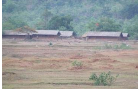
Non evacuation of PAPs from Dam base

was not completed despite an expenditure of ₹ 113.04 crore (April 2012) and no tender for execution of head works was in force (April 2012). The head works was partially completed as shown in the photographs.