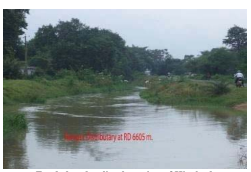
Eroded and unlined portion of Hirakud Distribution System not covered under RIDF