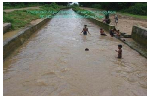
Renovated portion of Hirakud Distribution System

We noticed that the approved plan was deviated during execution. Drainage siphons (25 numbers) and village road bridges (23 numbers) approved for construction were not executed and of the 13.385 km, the Department improved 6.255 km leaving 7.130 km unexecuted and covered other unapproved portion for 17.702 km. In execution of protection wall, of the 15.163 km approved, 9.022 km was executed leaving 6.141 km unexecuted and unapproved portion of 27.488 km was executed. The works were executed in disintegrated manner in patches. The photographs indicate lack of continuous improvement to the canal.