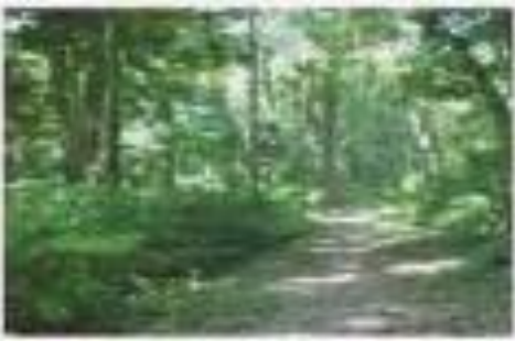
Moderately Dense Forest