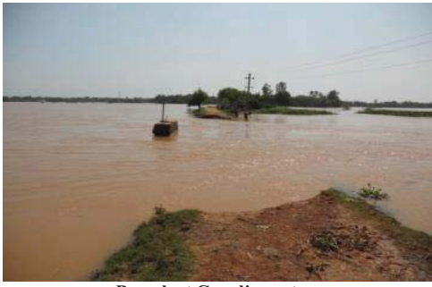
Breach at Gopaljewpatna