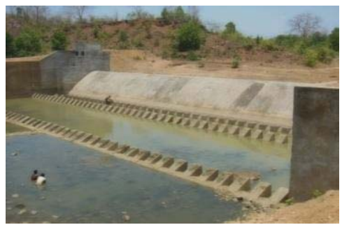
Completed Head Works of Saldihi MIP

systems were not taken up as of March 2012 due to non-acquisition land (30 projects), finalisation of the ayacut planning of the distribution system (15 projects), delay in finalisation of tender (3 projects) and delay in award of work projects) resulting investment of ₹ 50.04 crore not yielding any results.