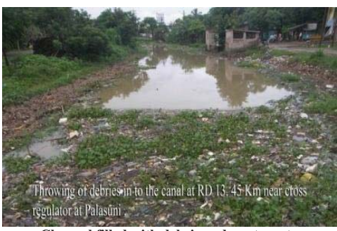
Channel filled with debris and waste water

Before commencement of work 7.800 km (Palasuni to Garage Chhak) was transferred (September 2010) to Works Department for renovation and development of a four lane road involving ₹ 28.71 crore. Only, 813 metre of the canal was improved (March 2012) with expenditure of ₹ 1.38 crore (Out of