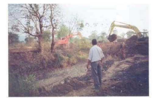
Kusumi Nallah excavation by excavator

We noticed in 13 (three Drainage Divisions<sup>14</sup>) out of 68 projects sanctioned for ₹53.37 crore under tranche XIII to XVII that the EE/SE/CE chose to adopt manual excavation of earth work in drains/