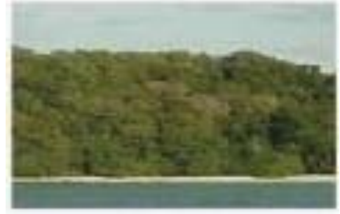
Verv Dense Forest

of Forest Report 2011 published by the Forest Survey of India (FSI). Though it was more than the percentage laid out in the National Forest policy, there was decrease in Very Dense Forest (VDF) by 13 sq km and Moderately Dense Forest (MDF) by 28 sq km with increase only in Open Forest (OF) by 89 sq km as per FSI report of 2009 and