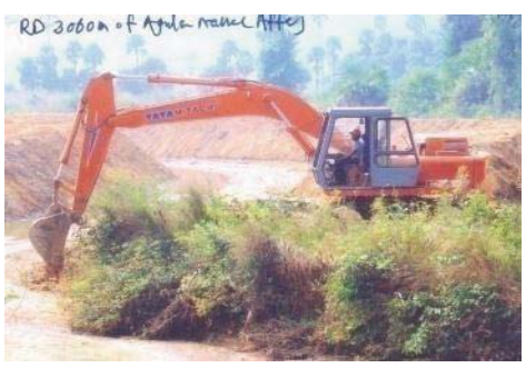
Agula Nallah excavation by excavator

drainage channels in the DPRs (estimates) at rates between ₹ 35.80 and ₹ 68.41 per cum. The works with the inflated costs (excavation by manual means) were put to tender. However, as per the notice inviting tenders, availability of machinery (excavator) required for execution of the work was one of the criteria to qualify for the tender. The works were executed during 2008-12